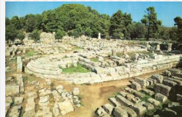
Ancient Olympia: Parliament