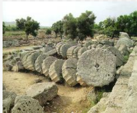
Ancient Olympia: Temple of Zeus