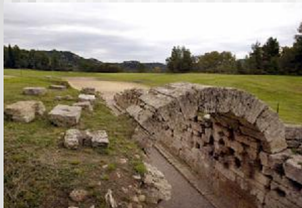
Ancient Olympia: Stadium entrance

Organised by the World Heritage Center of UNESCO