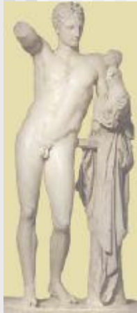
Hermes of Praxitelis