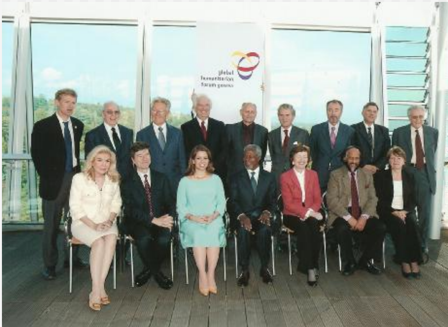
The Founding Board of GHF